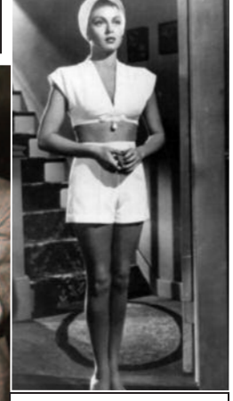
Lana, sexbomb goddess of film noir

Blood Moon Productions is a feisty and independent publishing enterprise dedicated to researching, salvaging, and indexing the oral histories of America's entertainment industry. As described by The Huffington Post, "Blood Moon, in case you don't know, is a small publishing house on Staten Island that cranks out Hollywood gossip books, about two or three a year, usually of five-, six-, or 700-page length, chocked with stories and pictures about people who used to consume the imaginations of the American public, back when we actually had a public imagination. That is, when people were really interested in each other, rather than in Apple 'devices.' In other words, back when we had vices, not devices."